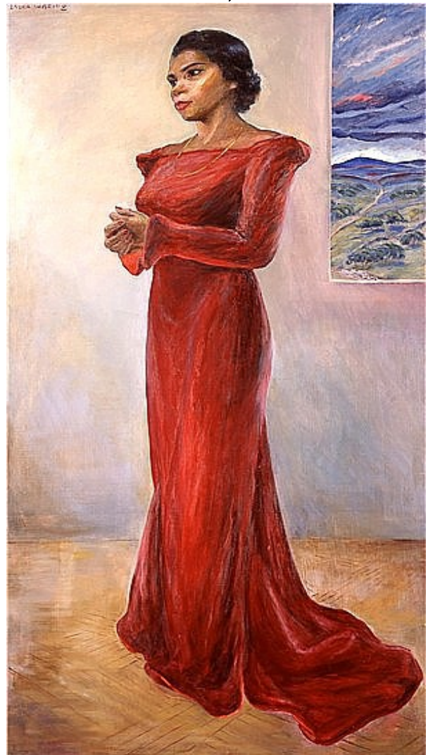
Singer, Marian Anderson, Laura Wheeler Waring

Beautiful Shades of Brown The Art of Laura Waring by Nancy Churnin